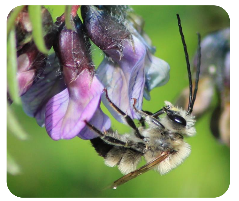
From left to right: Bombus lapidarius on Trifolium repens, Colletes daviesanus on Tanacetum vulgaris, Bombus pascuorum on Symphytum officinale and Eucera sp. on Vicia sepium.